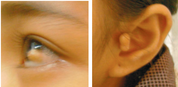
Figure 2. Limbal dermid and pre-auricular tag