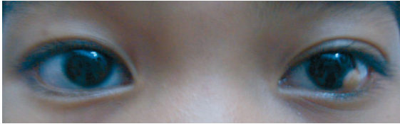
Figure 1. A girl with limbal dermid