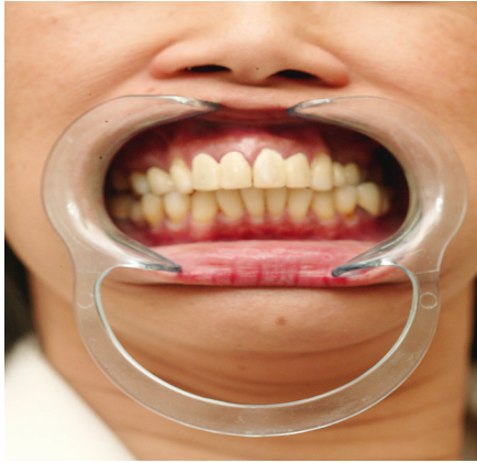
Figure 4. Cementation of first temporary posts and crowns.