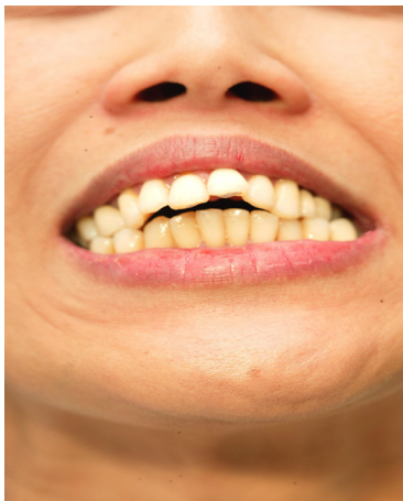
Figure 1. Patient's anterior teeth condition before treatment.

A forty-year old female patient came with crowded and protruded anterior dentition (Figure 1). This patient worked as a public relation representative in a private company. In the first appointment, anamnesis and clinical observation were done. From anamnesis, it was found that the patient had refused orthodontic treatment since it required more time and discomfort during treatment. On clinical examination, it was found that the patient was in good health. After thorough explanations, the patient approved and consented about conservative esthetic rehabilitation procedure through conventional endodontic treatment. The restoration planning was determined using cast post and all ceramic crowns. Alginate impression was done to produce the study model and temporary crowns as provisional restoration.