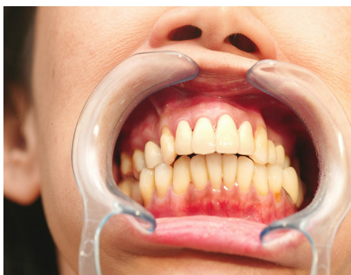
Figure 10. Final esthetic result.