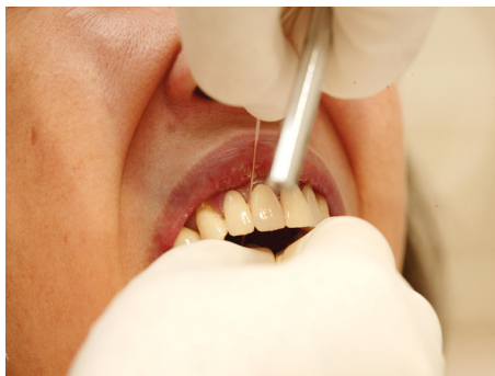
Figure 9. All ceramic crowns in place.