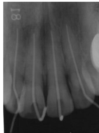
Figure 2. Gutta point trial photo.

After decapitation and post preparation, double impression was done (Panasil Kettenbach) as a mould to fabricate the Ni-Cr post and core. Bite registration record was taken, and then the impression was sent to dental laboratory with a written detailed laboratory prescription. The first temporary provisional acrylic crowns (Tempron GC) with post and core were cemented (Figure 4) using temporary cement (Freegenol GC).