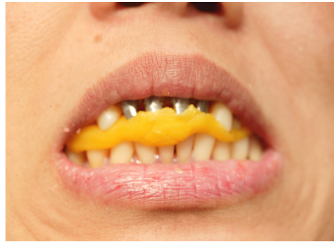
Figure 7. Bite registration record for the final restoration.

were cleaned and the teeth were prepared for temporary provisional crowns cementation (Freegenol GC). The second temporary provisional crowns (Tempron GC) were cemented, the impression result was sent back to the dental laboratory for all ceramic crowns production along with a detailed laboratory prescription. For color mapping, a Vita shade guide of A3 was selected, as well as explicit details about what to be done regarding the anatomical morphology, normal anterior alignments, and occlusion.