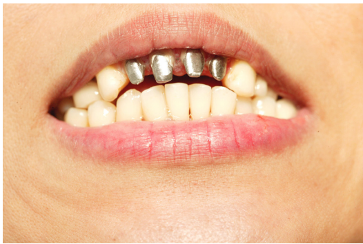
Figure 5. Cementation of cast posts and cores.

removed and cleaned. Cast posts and cores from the lab was cemented permanently (Figure 5) using luting cement (Fuji I GC).