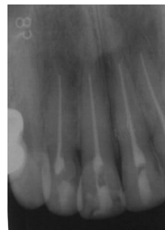
Figure 3. Obturation photo.

On third visit, before the temporary restoration was removed, alginate impression (Chroma Heraeus) was taken as mould for further making of direct provisional crown from acrylic (Tempron GC). There was neither patient complaint nor pain reported during one week after endodontic treatment although analgesic was not administered. After the cast posts and cores from dental laboratory were available, the temporary restoration was