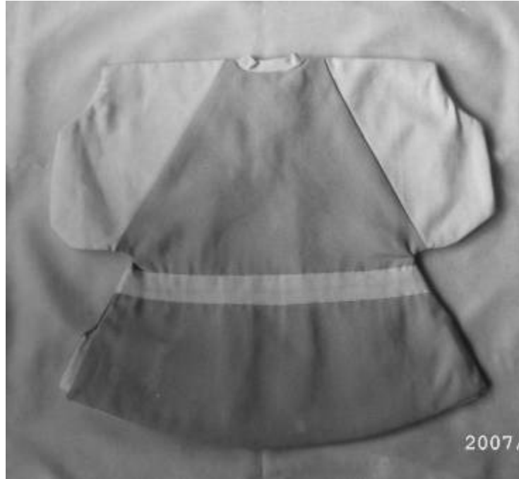
Back view of Buddhism monk cloth