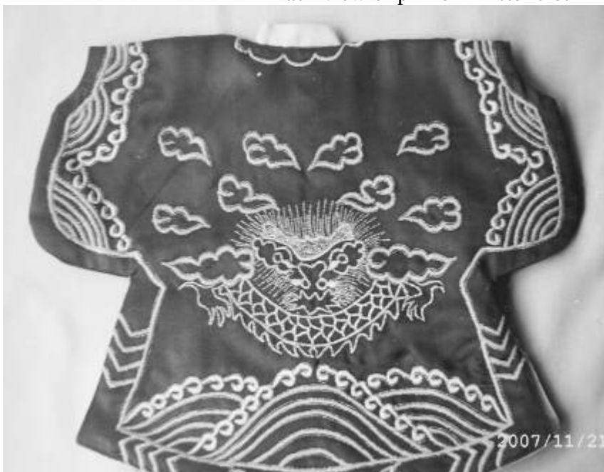
Source: primary data. Taken: 21-11-2007

In a flash prime minister cloth seem equal to emperor adviser cloth. Something distinguishing it with the emperor adviser cloth is only the primary color and decoration in mount motive edge at the cloth backside. If primary color of emperor adviser cloth is