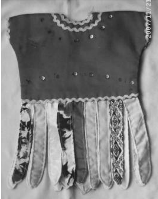
Picture 4. Back view of queen cloth