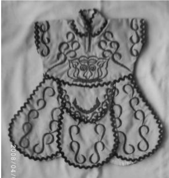
Picture 19 front view of officer cloth