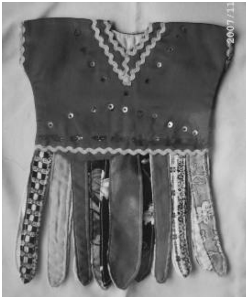
Front view of queen cloth