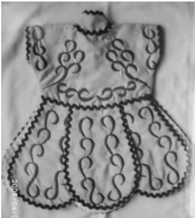
Picture 20 Back view of officer cloth