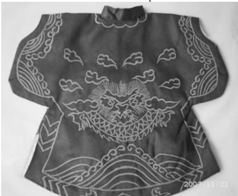
Source: primary data. Taken: 21-11-2007