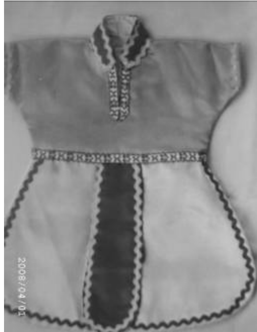
Source: primary data. Taken: 01-04-2008