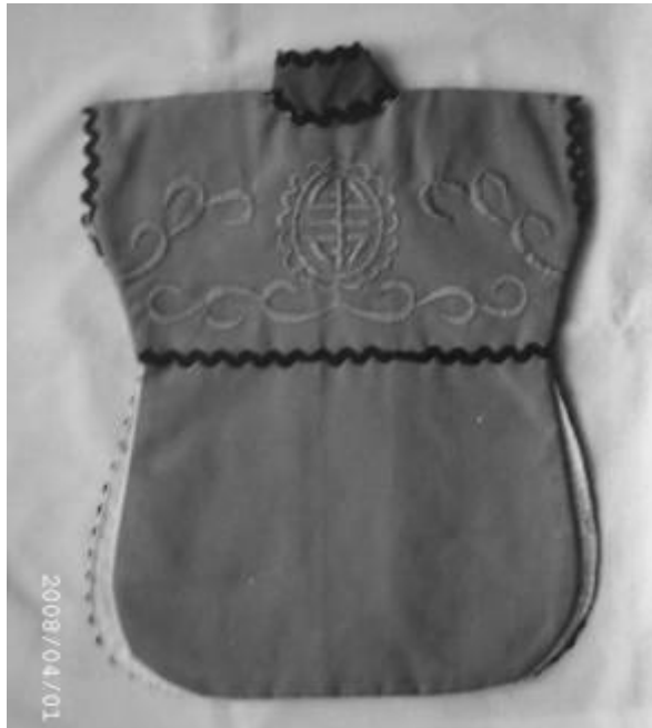
Picture 28 Back view of swordsman clothes