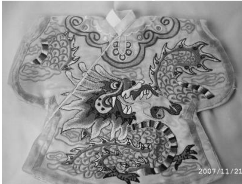
Picture 1. Front view of Emperor cloth