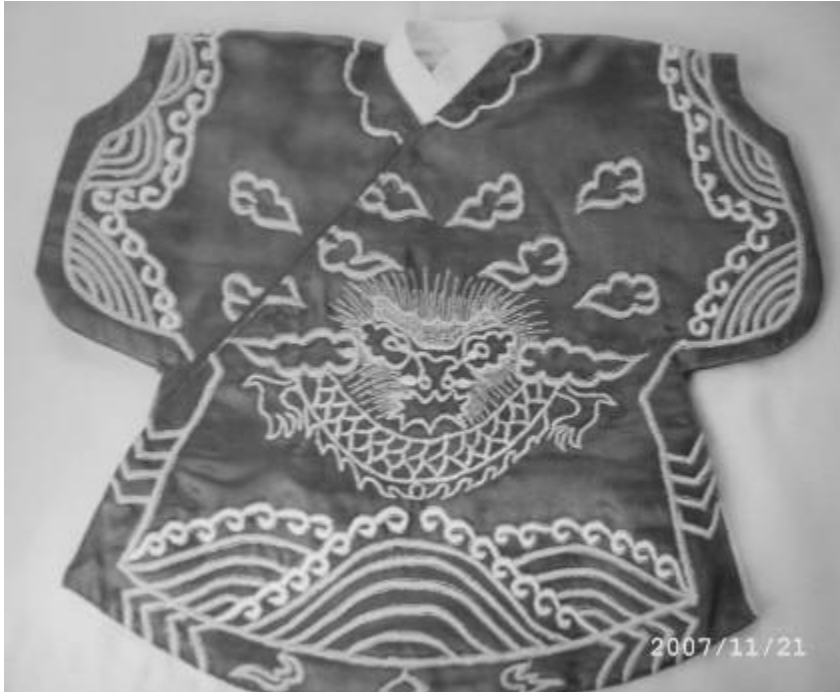
Source: primary data. Taken: 21-11-2007