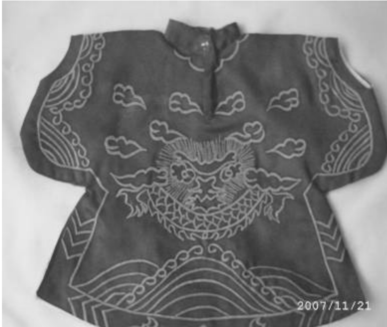
Source: primary data. Taken: 21-11-2007