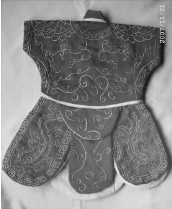
Picture 18 Back view of commander cloth