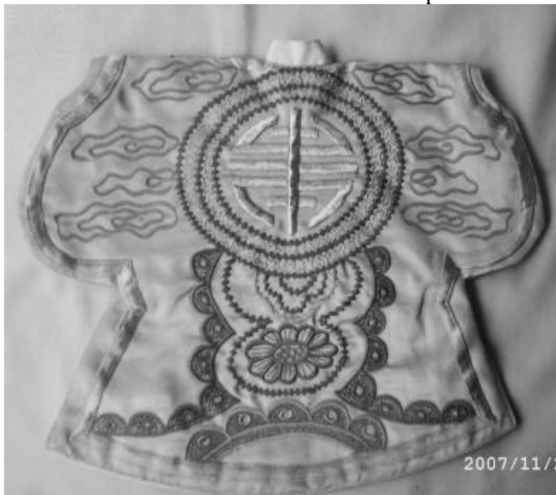
Picture 2. Back view of emperor cloth