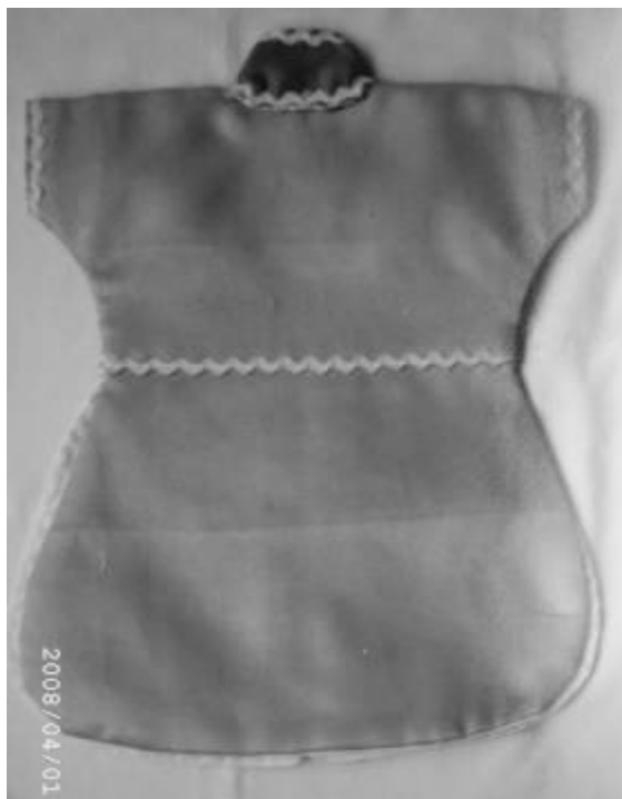
Source: primary data. Taken: 01-04-2008