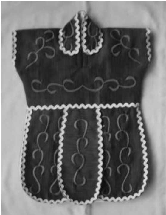
Front view of swordsman cloth

Source: primary data. Taken : 01-04-2008